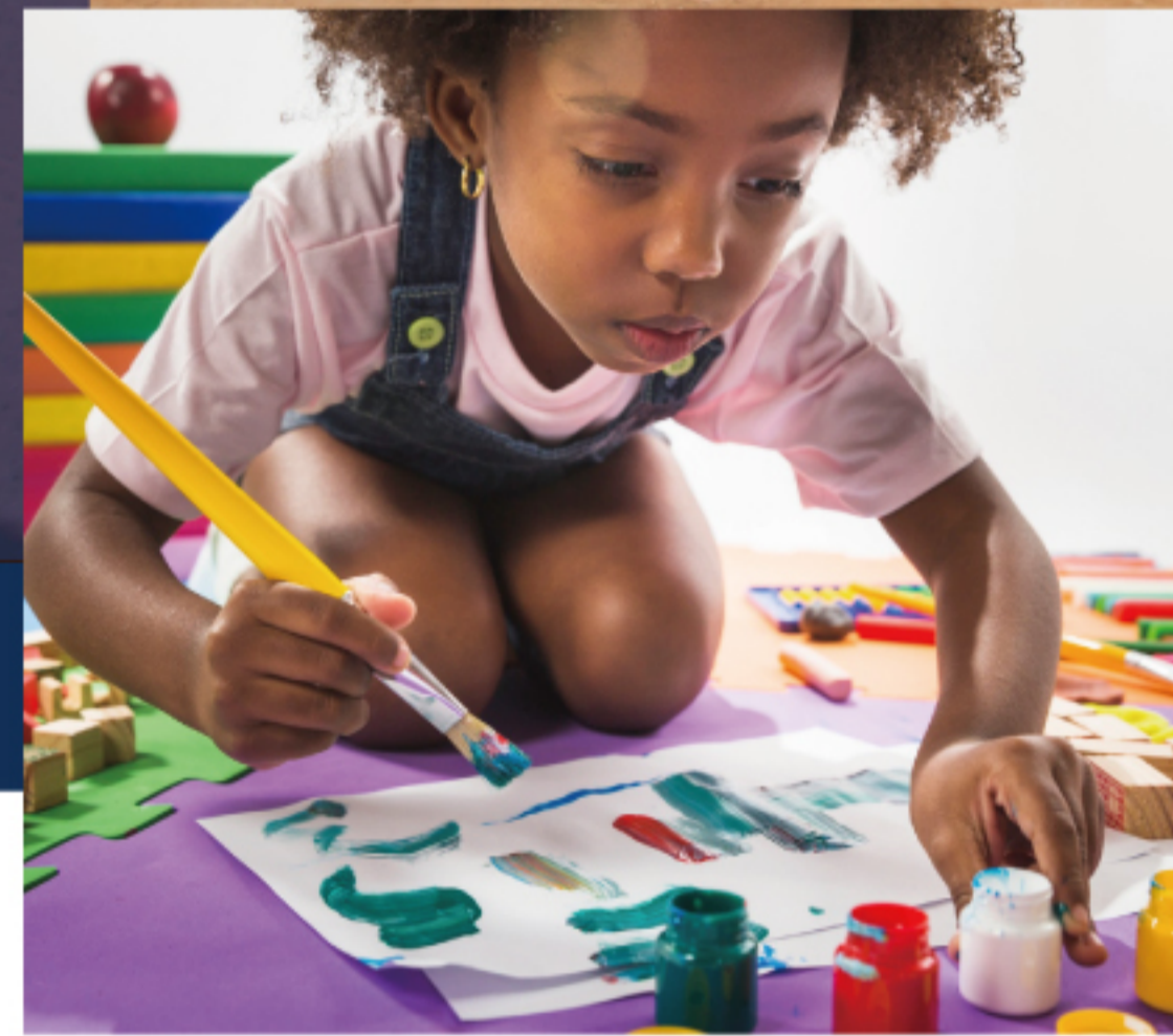
Art & Craft